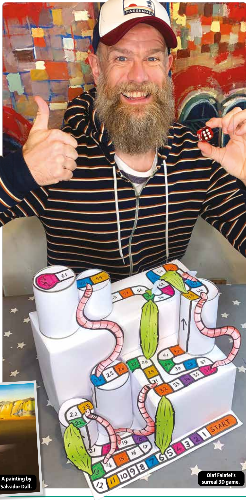
Olaf Falafel's surreal 3D game.